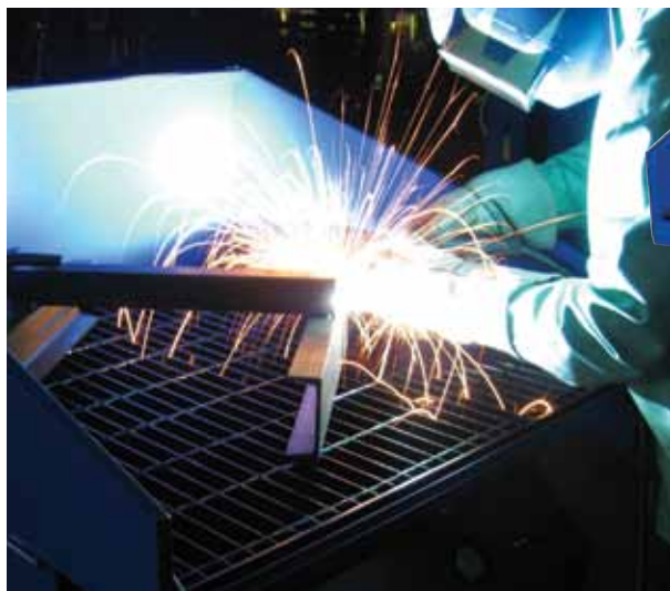
Hot welding fumes are pulled down and away from the operator.